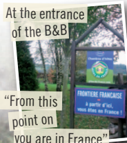
"From this point on you are in France"