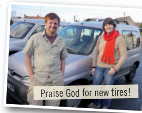
Praise God for new tires!