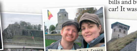
Some views of Givet, France